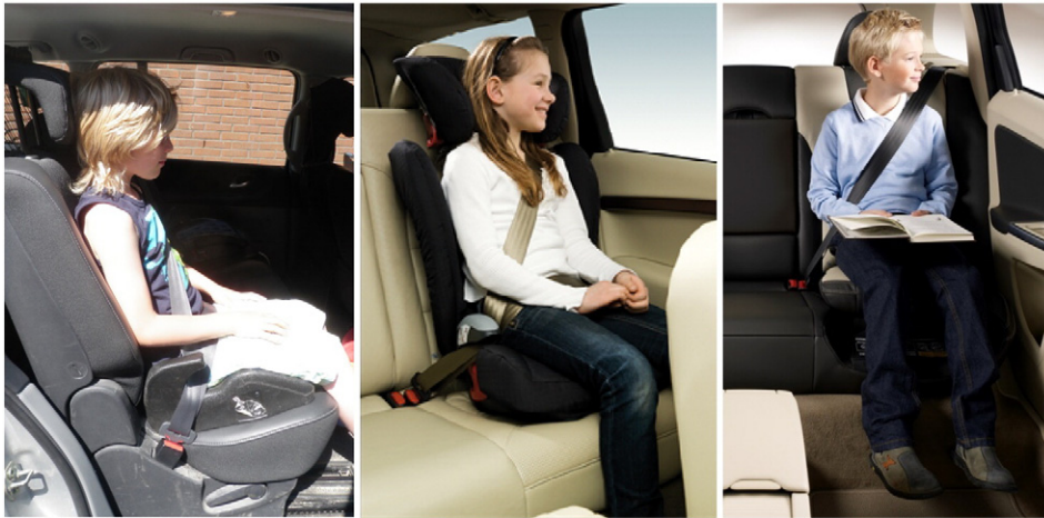
Fig. 5. Illustration of belt fit for children using, from left to right: belt positioning booster cushion, highback booster seat (Copyright Volvo Cars), and integrated booster cushion (Copyright Volvo Cars).

sleeping, larger head side supports increased the likelihood of a more forward seated posture without head and shoulder contact with the booster's back, as compared to smaller or no head side supports [31, 34]. Possible reasons for this behavior were discomfort, looking out