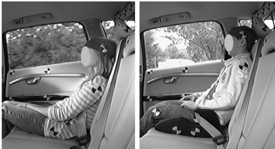
Fig. 7. Examples of slouch in [35] for a child seated directly on the rear seat (left) and a child of the same age seated on a belt positioning booster cushion (right).

children were not able to sit comfortably with their entire back and arms within the side supports, especially not when they were using a smart phone or similar devices. Furthermore, individual variation in seated posture among children when seated on the highback booster seat was greater than when seated on the integrated booster cushion [31]. During long periods of on-road driving, children showed noticeable signs of tiredness or discomfort by changing posture more often compared to at the beginning of the ride, and choosing either an upright sagittal posture without seat back contact or a forward leaning torso posture to support the upper body with their arms [34].