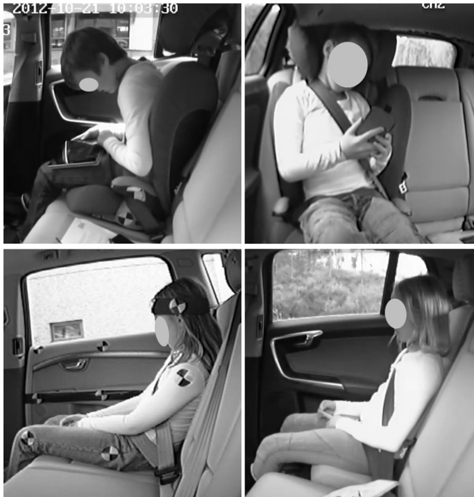
Fig. 6. Examples of voluntary seated postures in [31,35], from top left to bottom right: forward leaning posture when the child is playing with a smart phone; rotation of the upper torso to play with a smart phone when seated in a highback booster seat; slouching to comfortably accommodate bent knees when seated directly on the rear seat; child seated on an integrated booster.

through the side window, and talking to the driver. Children aged 7 to 9 years when seated on a highback booster seat spent less time seated with the upper back and shoulders in contact with the backrest compared with children on integrated booster cushions [31]. Also, several