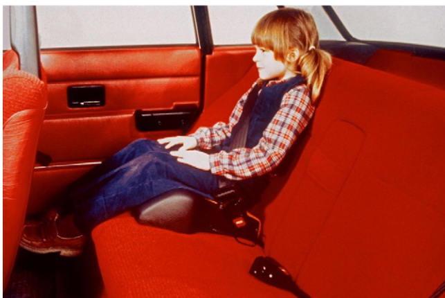
Fig. 4. World's first booster cushion from 1978 [26].

The adult seat belt in combination with a booster is recommended for ages 4 to 12 years. For smaller children, the rearward facing seat offers the best protection for the pelvis during a frontal impact by transferring the loads to the pelvis by the seat back. The child is secured in the rearward facing seat by a harness including a crotch strap that keeps the lap belt down on the pelvis (Fig. 3).