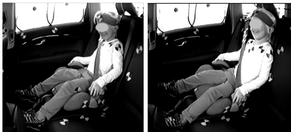
Fig. 8. Example of a short child in an involuntary seated posture during the emergency steering event in [37].

In a maneuver study comprising child volunteers [37,38], vehicle and video data was recorded simultaneously to enable a direct relation between child kinematic responses, vehicle interior and vehicle movement. Sixteen children aged 4 to 10 years-old were exposed to evasive braking and steering events when seated in different restraint systems. During braking events short children moved forward and downward with a greater flexion motion of the head compared with the tall children who had a more upright forward motion. The head trajectories were influenced by the size of the child and the restraint system used. The backrest of the highback booster seat affected the initial position of the child relative to the vehicle and thus resulted in a more forward posture at maximum displacement. Furthermore, the maximum forward head position was outside the highback booster's side supports [38]. In the steering maneuvers, the seat belt slipped off the shoulder