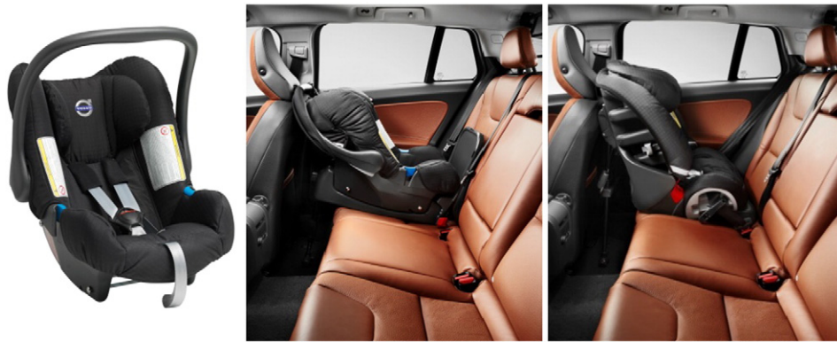
Fig. 3. Examples of rearward facing child seats, from left to right: a modern infant seat (up to 13 kg); infant seat attached with an ISOFIX-base; rearward facing child seat (up to 25 kg) attached with the vehicle seat belt.

thoracic spine as well. This kinematic response may partially explain the occurrence of head injury due to impact also among children of short stature identified in [6].