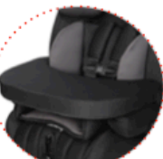
Table - Playtray and additional impact shield